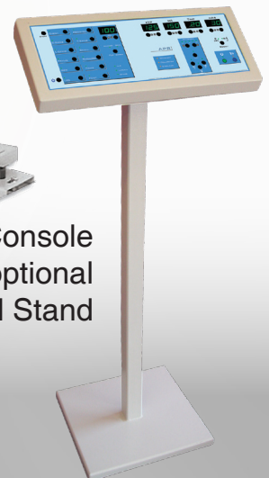
APR Console with optional Pedestal Stand

ISO 9001:2000 w/ Design ISO 13485 UL 2601