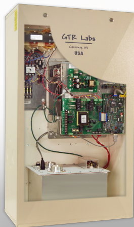
Patriarch High Frequency X-ray Generator