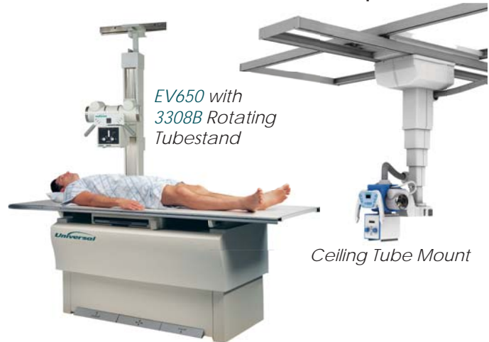
EV650 with 3308B Rotating Tubestand